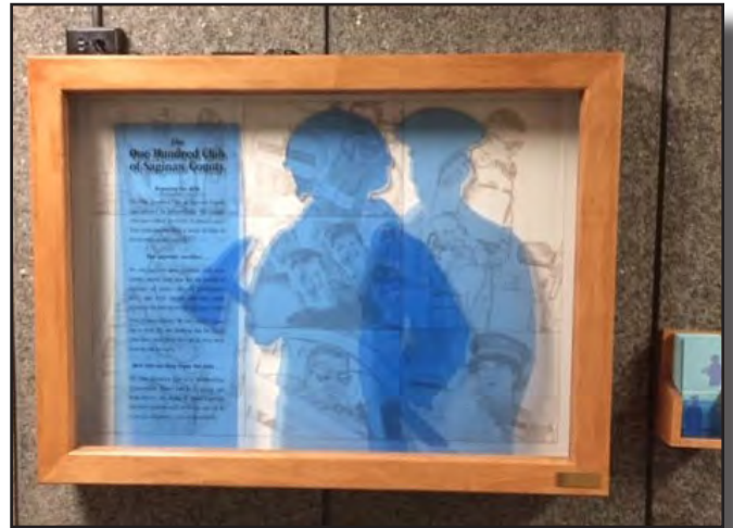
A commemorative plaque was donated to the 100 Club and now hangs in the lobby of Saginaw County Courthouse.

“Seeing what these two people do on a daily basis confirms the fact that the 100 Club of Saginaw County is a valuable and needed organization,” shared Judge McGraw. “Giving back is the least I can do.” ✎