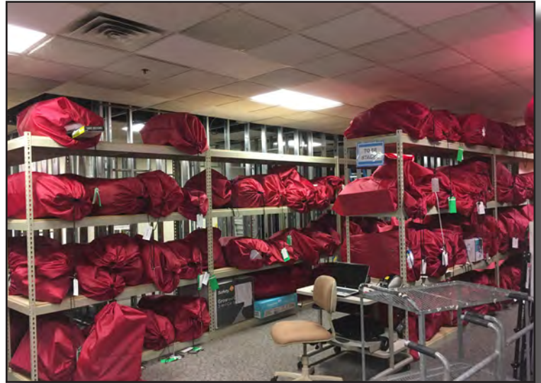
Dozens of bags of wrapped presents housed at the Friends of Foster Kids headquarters awaiting delivery to children in foster care in time for Christmas.