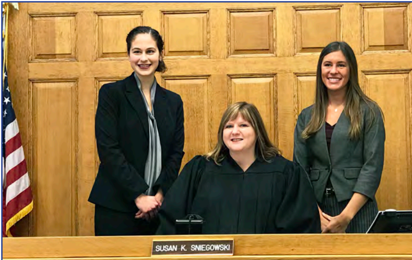
Judge Sniegowski with two of her former swimmers-- both of whom are now attorneys and one of whom she was able to swear in.

“I believe that engaging children in positive activities, such as youth sports or clubs, helps them develop into well-rounded individuals.”