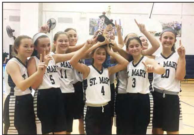
Winning the championship!