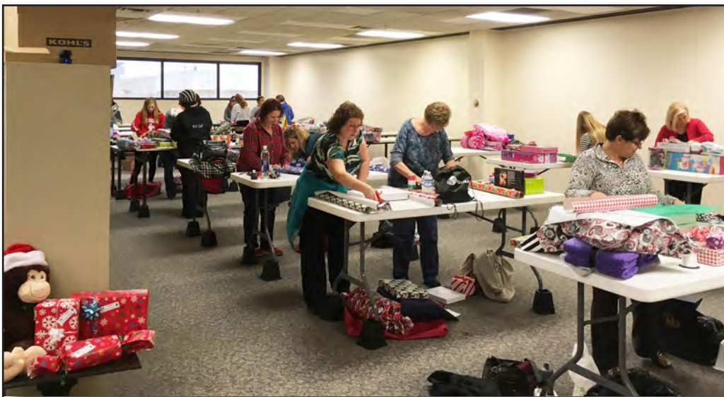
A well-oiled machine - “Angels” wrapping and bagging gifts.